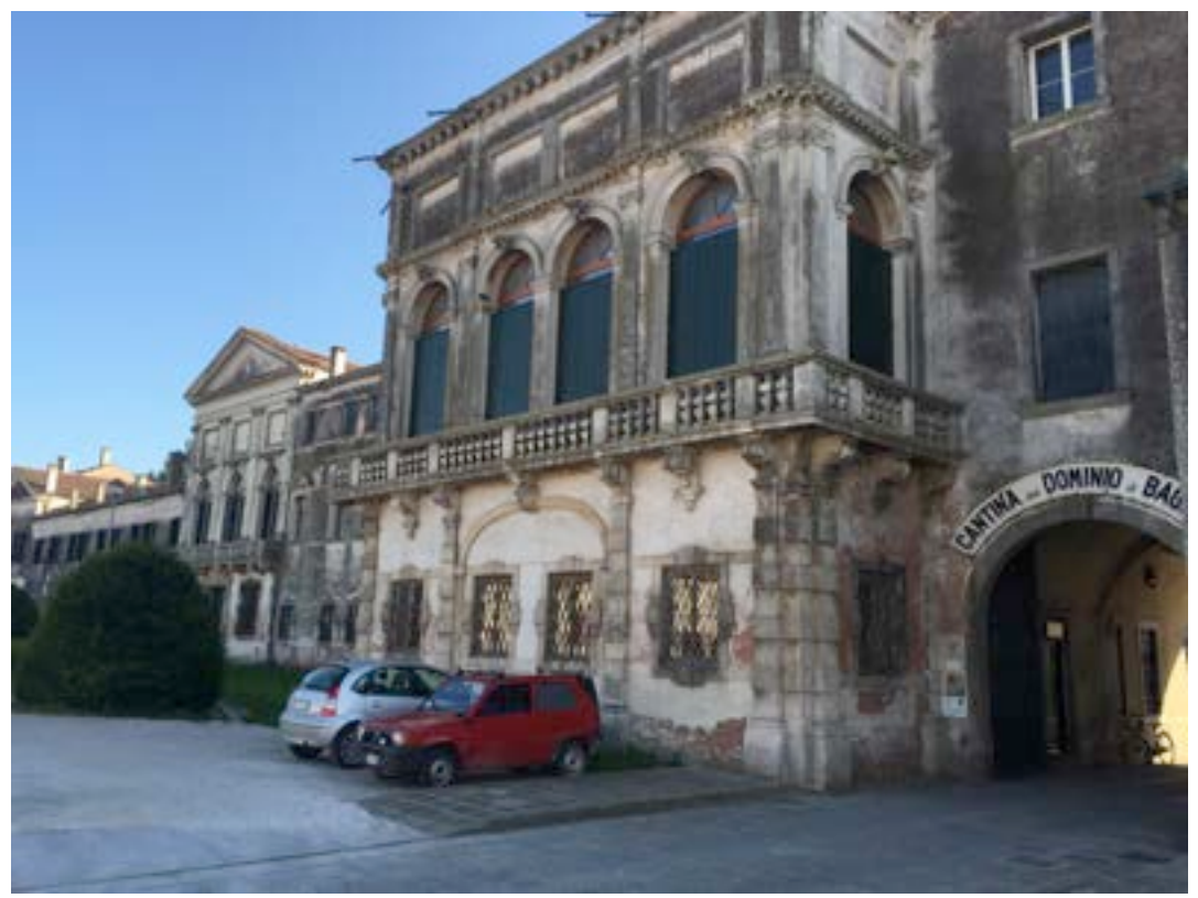
Bagnoli di Sopra

Bagnoli is worth a stop to see the villa, almost the whole town of Bagnoli. There is an interesting winery inside, they produce an original wine, the Friularo.