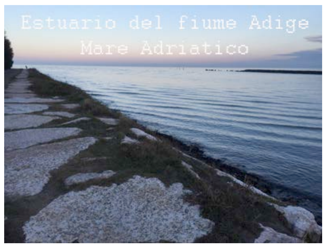
Estuary of river Adige

Once you arrived at the mouth of the Adige, go to Chioggia, a little Venice.