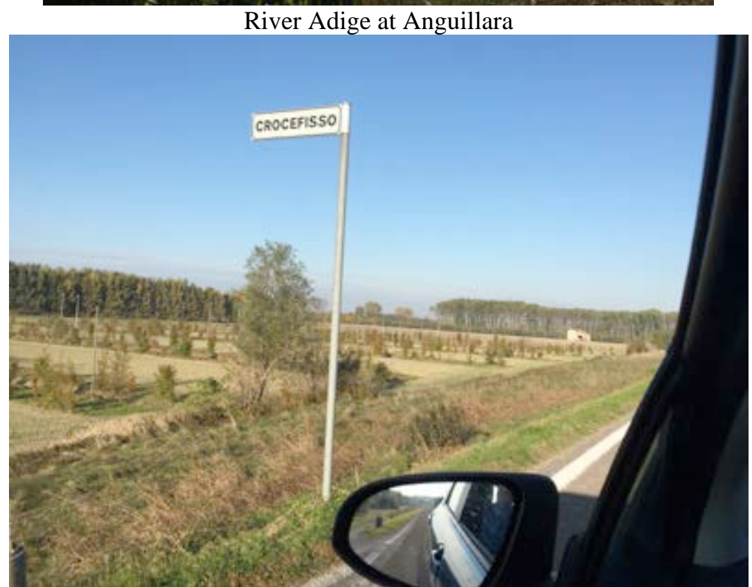
A place called Crocifix