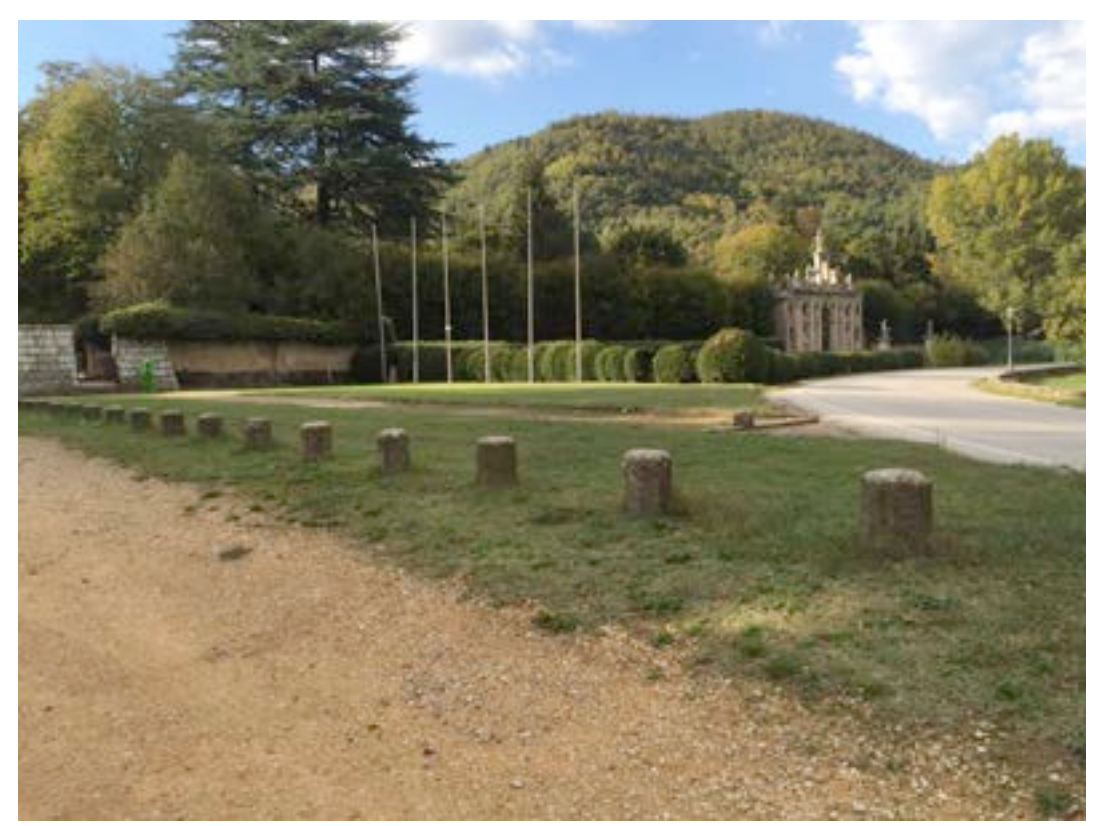
Giardino di Valsanzibio

From Valsanzibio take the road for Monselice and then to Conselve.