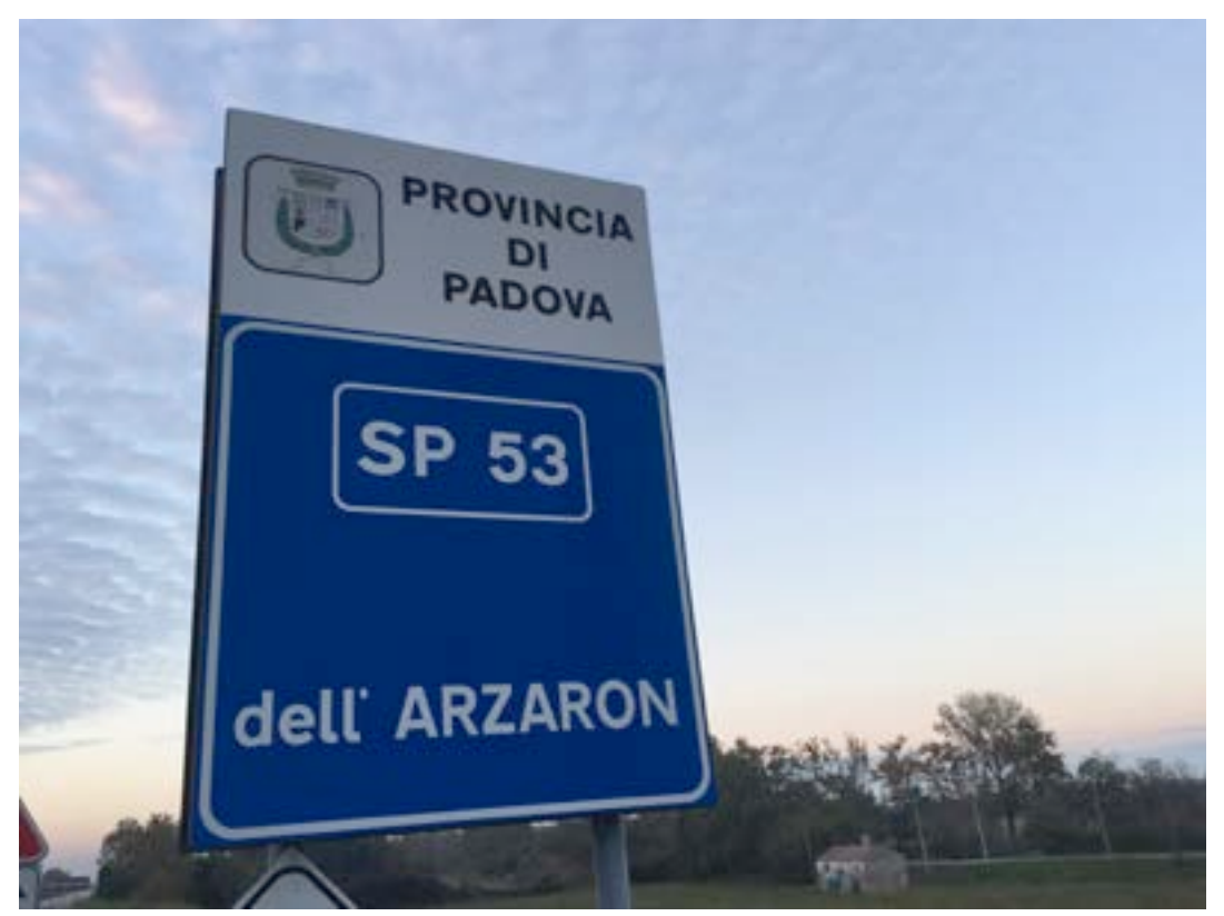
Road of Arzaron: river Brenta on the left, the lagoon of Venice on the right

This road runs along another great river, the river Brenta, to your left.