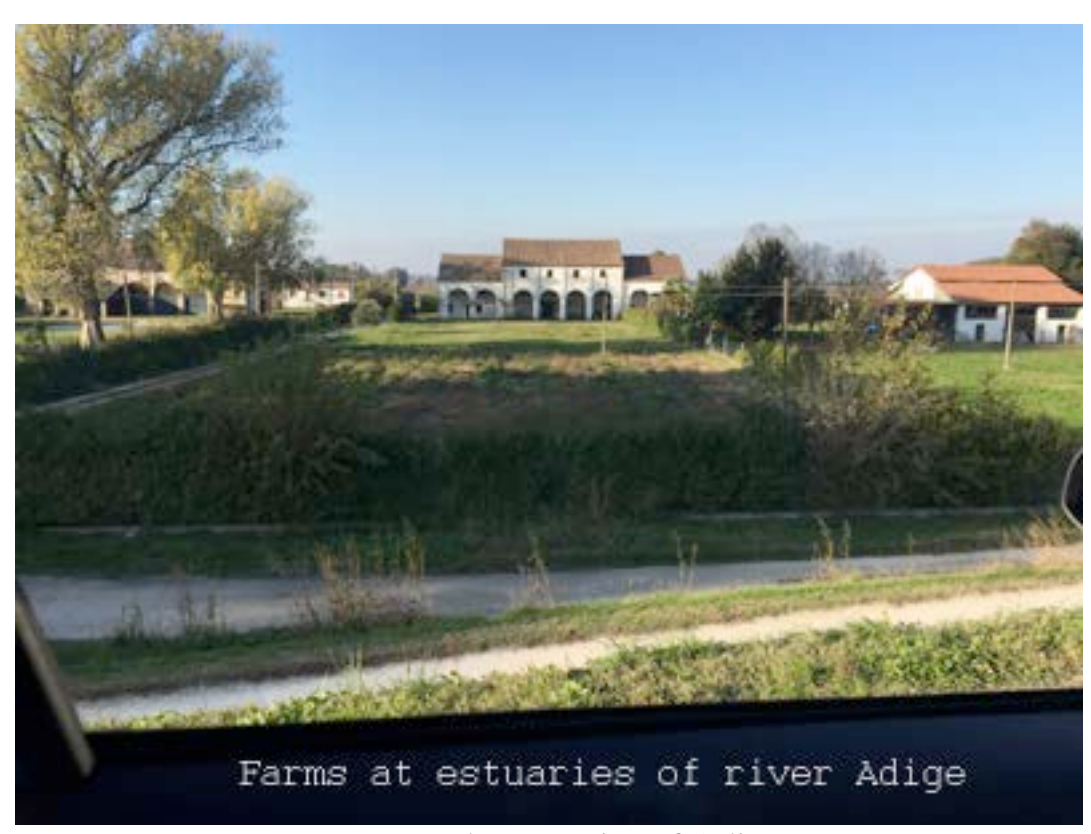
Farms at the estuaries of Adige

These areas were once very populated and wealthy. Rovigo in 1800 was the richest province of the Autrian-Hungaric empire.