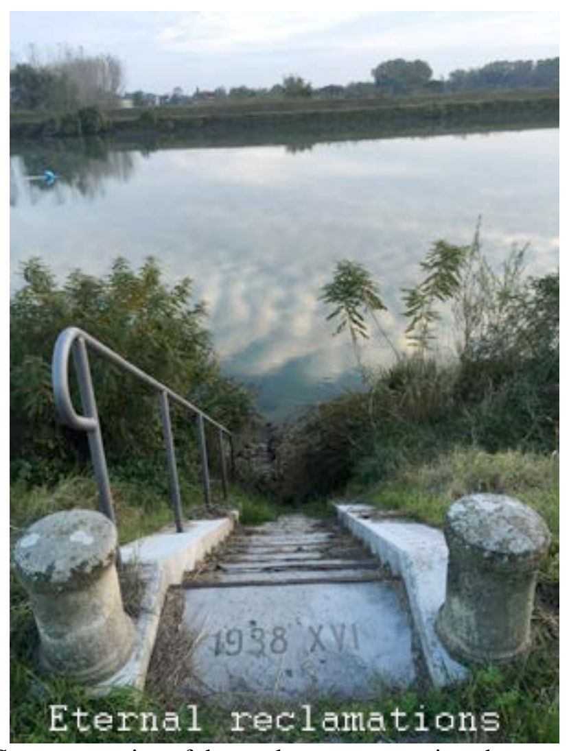
Commemoration of the work to protect against the water.

To remember him, there are several ways and places in Veneto, that bear his name. In Venice, there is a statue, just in front of the railway station Santa Lucia.